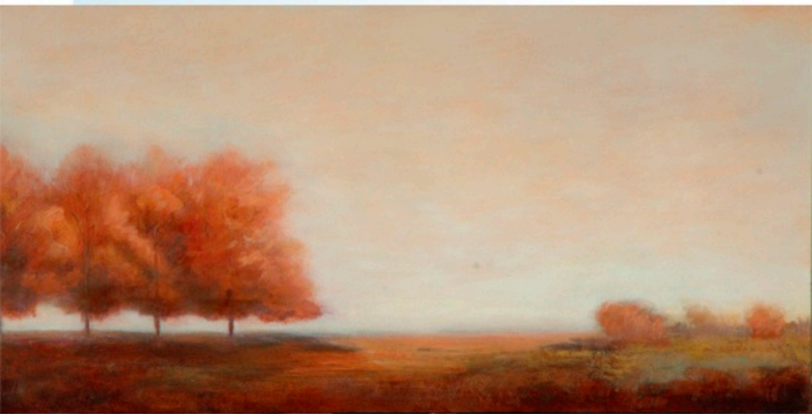
In the Lineup , oil, 24 x 48.

Group show, Pryor Fine Art , July 2013. Group show, Fort Worth Community Arts Center , Fort Worth, TX, November 8-December 27.