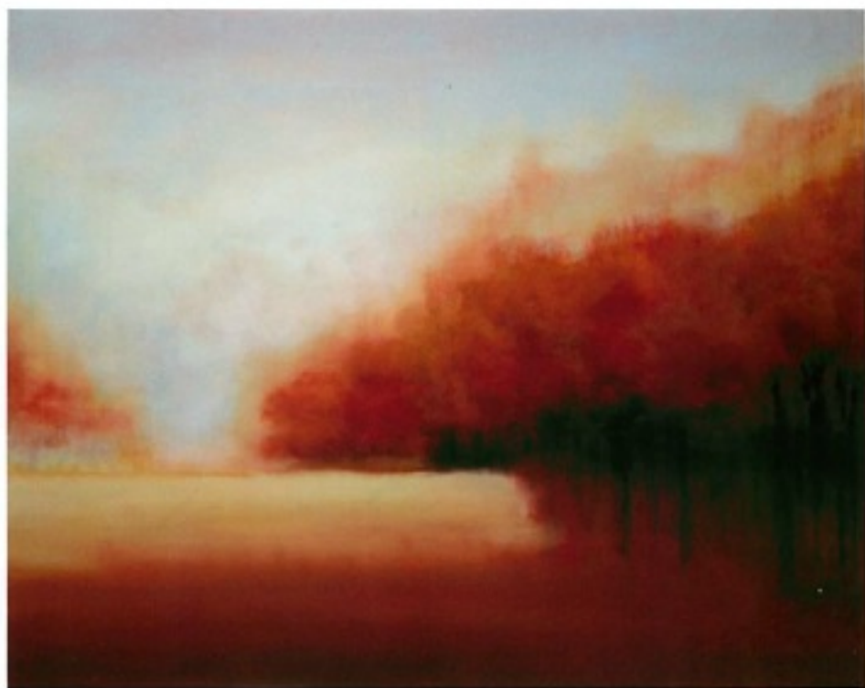
Red Hot oil on canvas, 48 x 60 inches