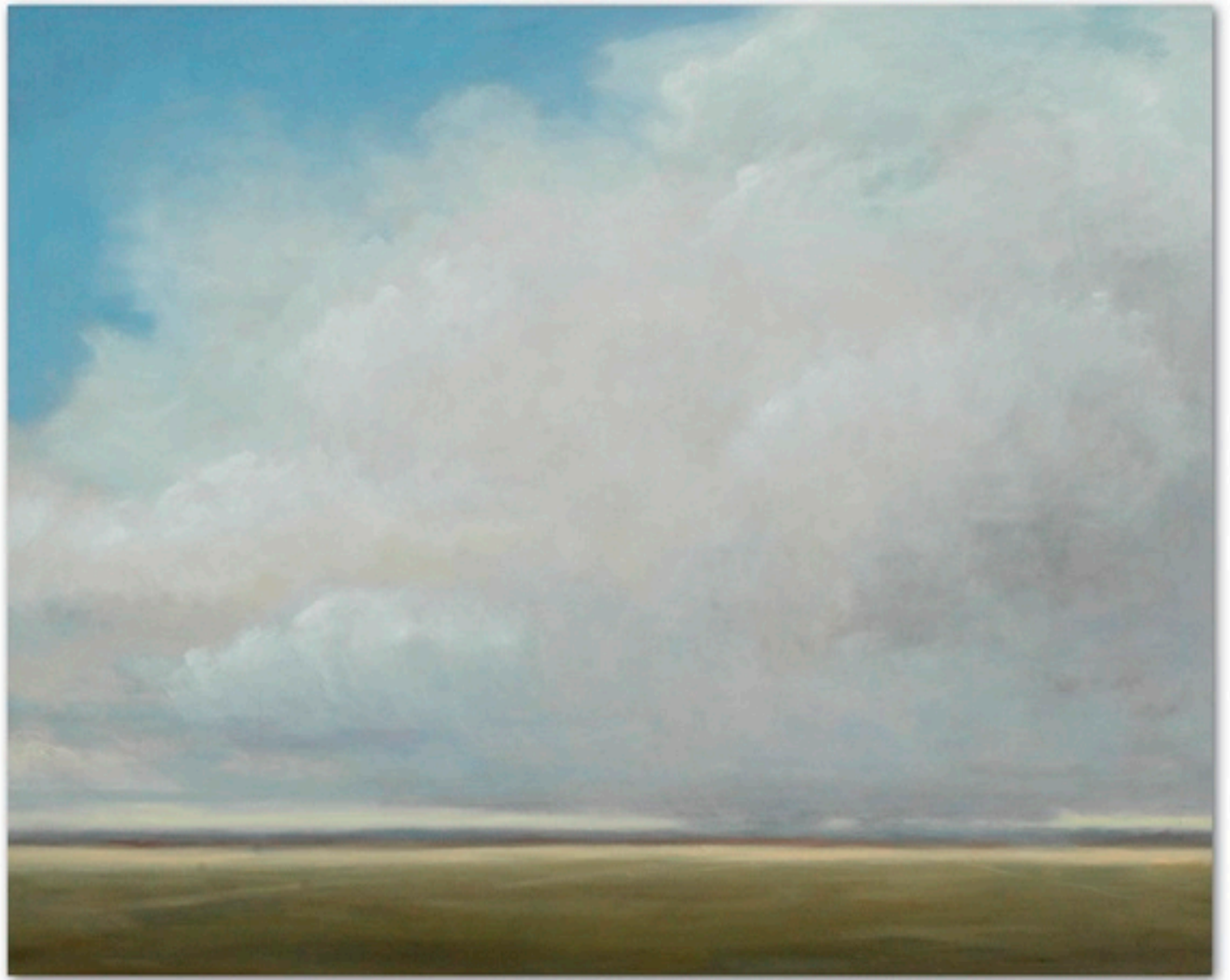
ROAD TRIP 48x60 oil on canvas